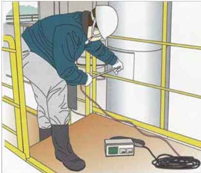
A technician uses the 6162 to measure air flow in the flue

result in a dirtier burn that produces more waste/pollution or wastes energy and time with an inefficient burn. In order to make sure this occurs the airflow must be precisely measured and controlled.