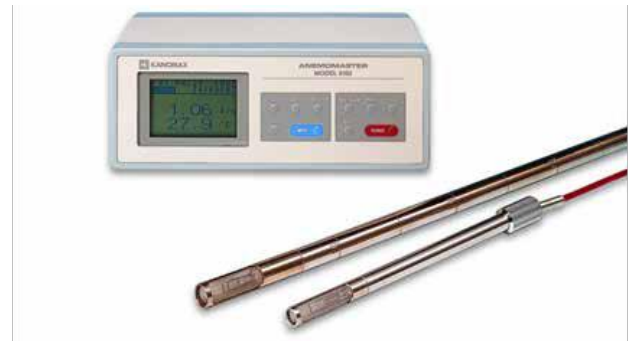
Model 6162 High Temperature Anemometer

Kanomax manufactures the model 6162 high temperature anemometer that can be used to measure airflow in the applications mentioned above. The instrument comes with a number of features and benefits that can solve the problem of measuring air flow in a high temperature environment.