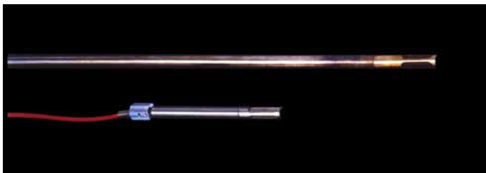
High temperature (top) and mid-temperature probes