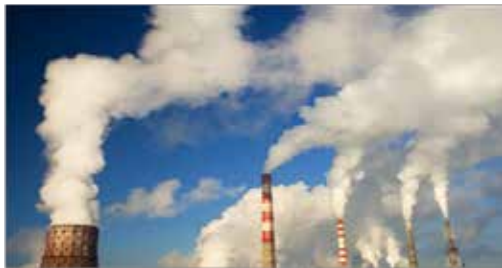
Incinerator exhaust pipes