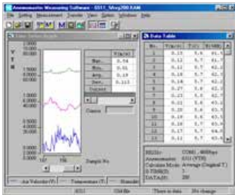
Optional Measuring Software

The instrument can use any of three optional probes, which are all field-swappable without the need to re-calibrate the instrument. The compact model 0203 mid-temperature probe is perfect for applications ranging from 32 to 392°F (0 to 200°C). Model 0204 and the shorter model 0205 are designed for high temperature applications and are rated from 32 to 932°F (0 to 500°C). Other important accessories include extension rods for specialized applications, and compression fittings that ensure a tight and proper fit for in duct/in process measurements. Further details about each probe, including its dimensions and cable lengths can be found on our website at www.kanomax-usa.com .