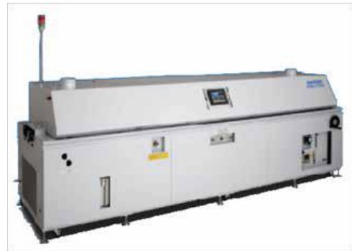
Examples of an incubator (bottom left) and a reflow oven (above) that may be tested for quality purposes with a high temperature anemometer prior to being sold