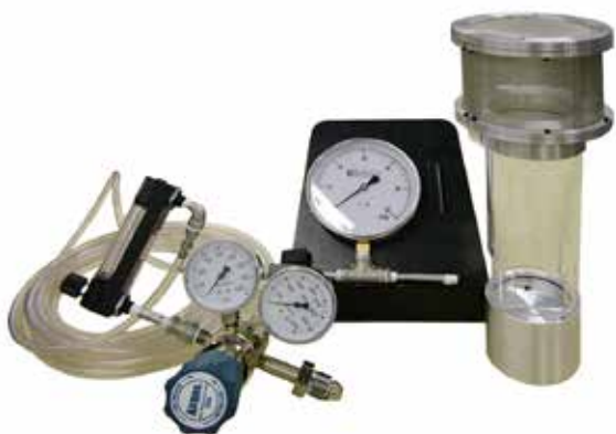
Kanomax Dif-Kit for Fume Hood Testing

Kanomax has delivered the best measurement solutions in its products and services that adapt precision measurement technology for fluids and particles. Kanomax product lines include anemometers, particle counters, dust monitors, and IAQ monitors. Kanomax is contributing to technological innovation and quality improvement for the processes of quality management, environment management, and technology development in the areas of environment, health, and energy, which are essential to sustain human well-being, as well as in other industrial areas including automobile, aerospace, semiconductor, electronics manufacture, heavy industry, steel, shipbuilding, pharmaceutical, biotechnology, food-processing, medical, construction, and civil engineering.