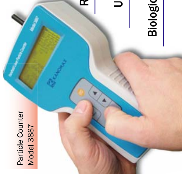
Particle Counter Model 3887