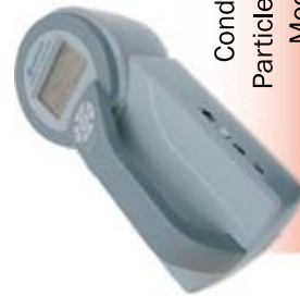
Condensation Particle Counter Model 3800

Detects ultrafine particles down to 15 nm