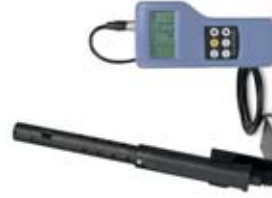
IAQ Monitor Model 2211

Measures particle concentrations of PM10