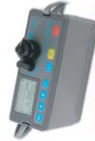
Digital Dust Monitor Model 3442

Detects ultrafine particles down to 15 nm