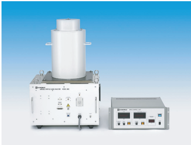
APM-3600 Analyzer and Control Unit

This unique analyzer classifies aerosol particles by mass using a true “first-principle” measurement technique.