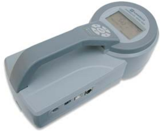
Handheld Condensation Particle Counter Model 3800

In Approaches to Safe Nanotechnology, NIOSH recommends direct-reading instruments and filter sampling with lab analysis to obtain particle number, size, and shape, degree of agglomeration, and mass concentration of elemental constituents in nanoparticles. Direct-reading instruments include both optical particle counters and condensation particle counters such as the Kanomax 3800.