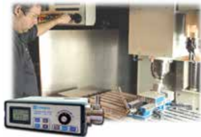
Monitoring Milling Operation