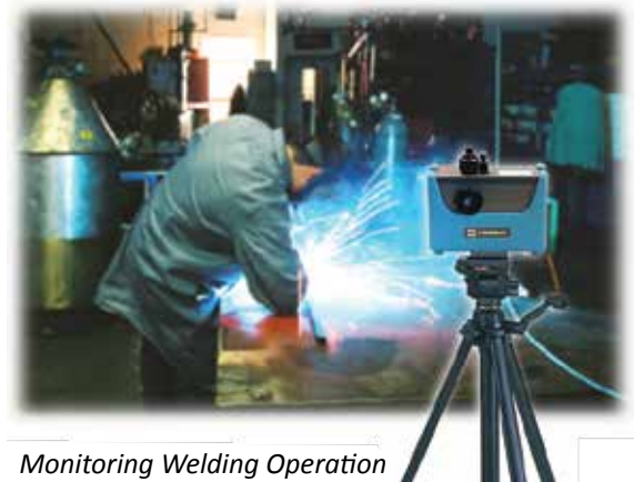
Monitoring Welding Operation

Applications for light scattering dust monitor include Indoor air quality investigations, Point source monitoring, and Personal exposure monitoring.