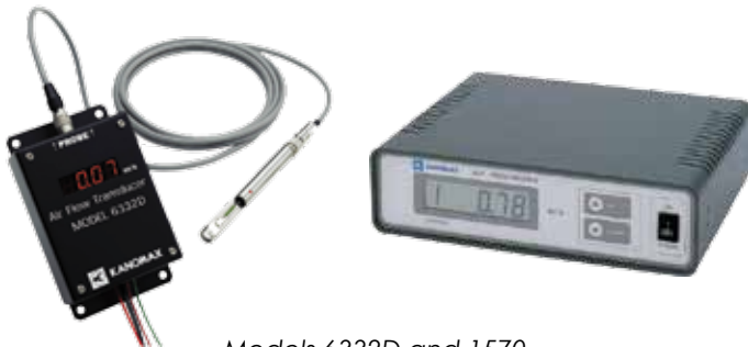
Models 6332D and 1570

When you order this product you will need the base unit, between 1 to 4 probes, and 1 cable for each probe you order. The probes do not have to be the same type and the cables can also be of varying lengths to suit your needs (standard cables range from 2 to 30 meters).