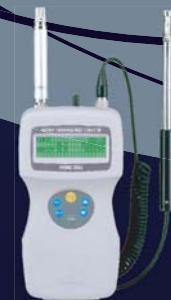
Instrument with Optional Air Velocity and Temperature/Humidity Probes